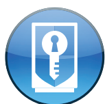
KeyOS MultiKey Server